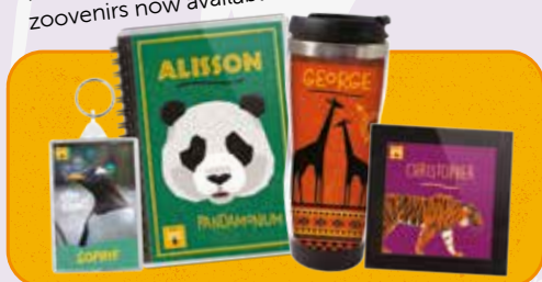
Photo and personalised zoonovins now available

Budongo Trail & Living Links last entry half an hour before closing