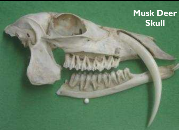
Musk Deer Skull