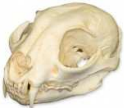
Eurasian Lynx Skull